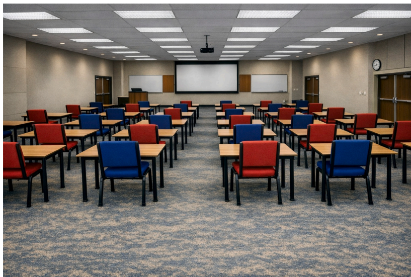
Fig. 1. Exam hall seating arrangement in alternating chair colors representing different courses.

This challenge has been intensified by larger educational reforms that expanded access to secondary education, thus increasing the pool of students eligible for university admission [14]. As secondary education becomes more widely accessible, the transition rate to tertiary education continues to increase, placing additional pressure on university facilities and examination management systems [15]. Consequently, higher education institutions face increasing logistical challenges in administering examinations for large student populations [16].