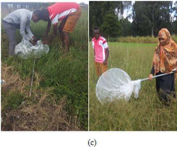
Fig. 1. Arthropod collection methods: (a) Setting of pitfall traps, (b) Beating sheet and (c) sweep nets